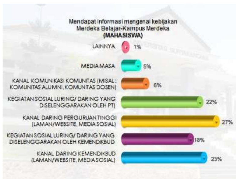
Figure 1. Results of the MBKM Policy Survey through SPADA December 2021

Based on Figure 3, the sources of information on MBKM policies for students come from 1) College online channels (Websites and Social Media) by 27 percent; 2) Ministry of Education and Culture's online channels by 23 percent; 3) Offline/online social activities organized by PT by 22 percent; 4) Offline/online social activities organized by the Ministry of Education and Culture are 18 percent; 5) Community communication channels by 6 percent; 6) Mass media by 5 percent; 7) another 1 percent.